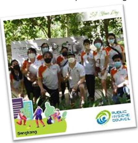
Check out more clean-up efforts at PHC's Facebook #SGCleanDay

Residents also geared up to conduct litter picking at their estates. One great example is the clean-up organised by Bishan-Toa Payoh Town Council. They partnered ITE College Central and the Zone 1 Resident's Committees to educate residents on keeping Singapore clean and clean-up their neighbourhood.