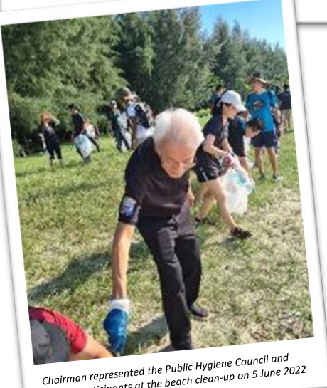
joined participants at the beach clean-up on 5 June 2022