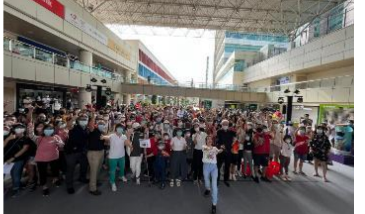
Participants posing for a photo at the KCS Closing Event held on 28 May 2022 at HDB Hub Atrium